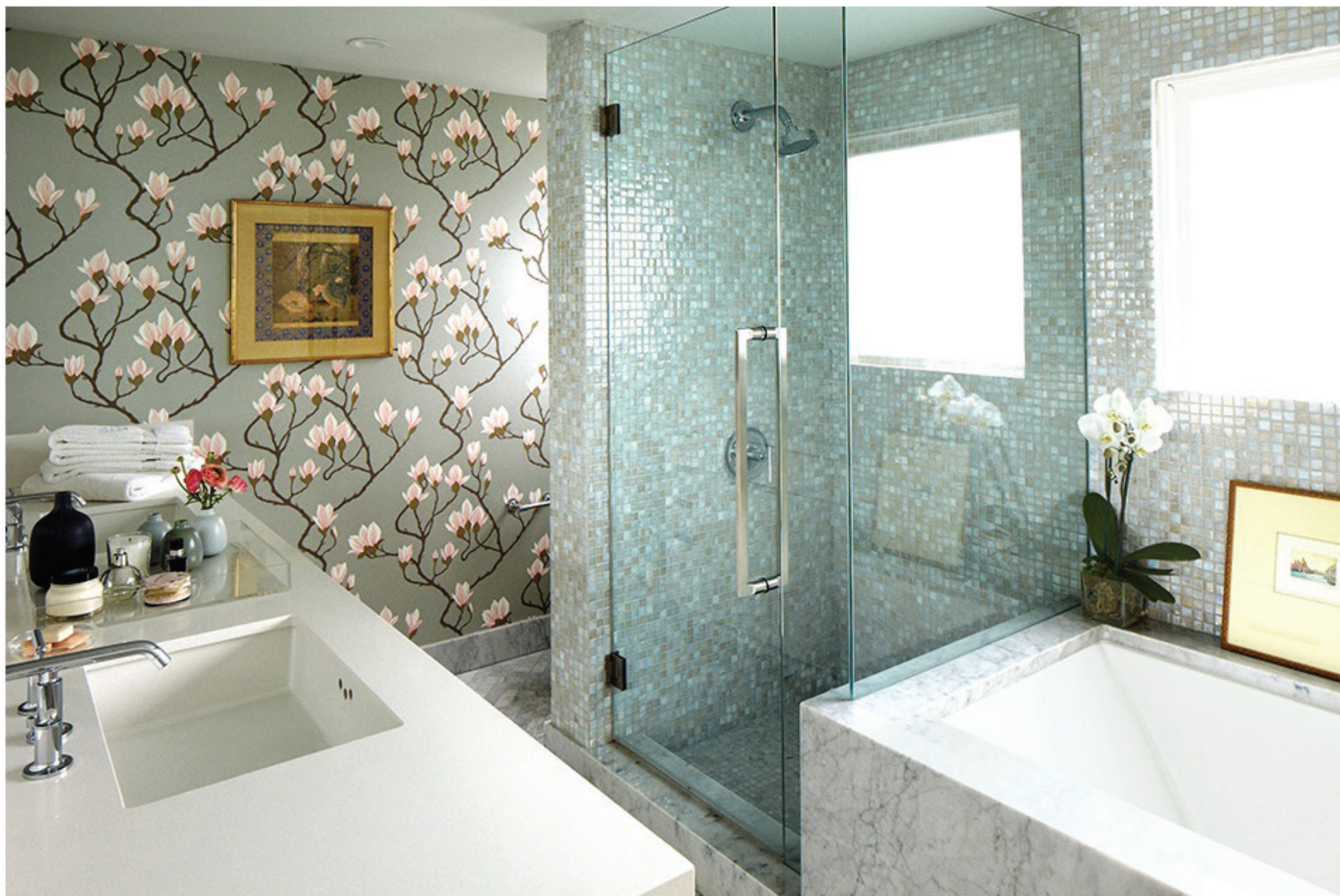
A floral wallpaper from Lee Jofa brings a touch of traditional Southern charm to the bathroom of a Los Angeles home.