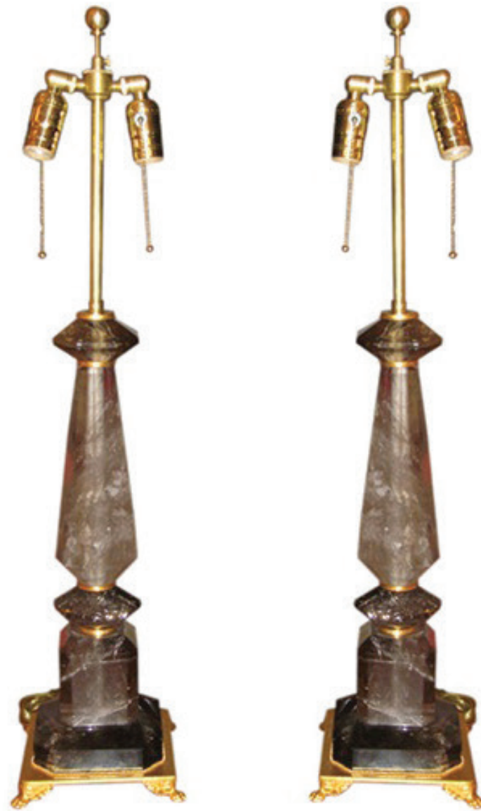
Pair of rock-crystal lamps, 21st century, offered by Lerebours Antiques